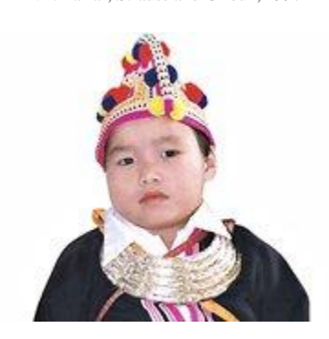
<u>Life Went On Around Her, Redefining Care by Bridging a Divide</u> -- Margalit Fox, The New York Times (15 September 2012)

"The Sacrifice" is available in your Moodle Folder via the sidebar . . . Course Resources > <u>Electronic Reserve</u>